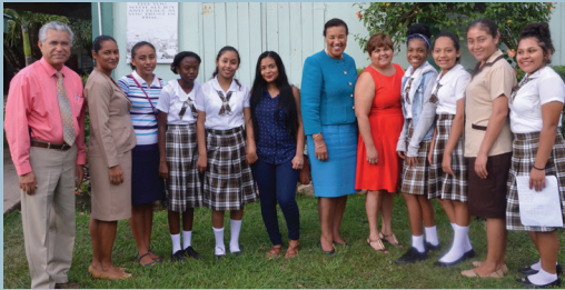
Visit to Belize