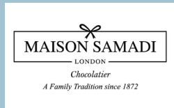
Sponsors of the gift basket