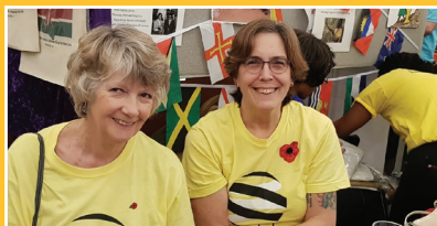
Volunteers for the Commonwealth Fair