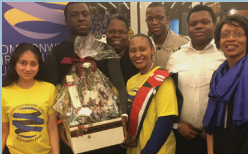
CCL Fair gift basket winner