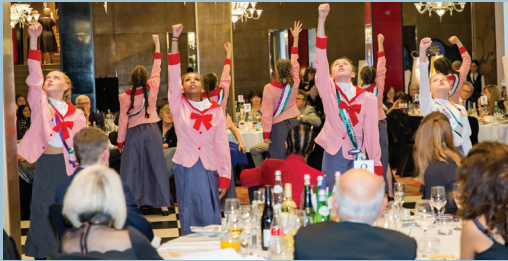
Splendours of the Commonwealth

10 April 2018: The CGEF hosted the 4th Splendours of the Commonwealth event at the May Fair Hotel. With the help of our volunteers, performers and speakers who represented all regions of the Commonwealth, we raised over £19,000.