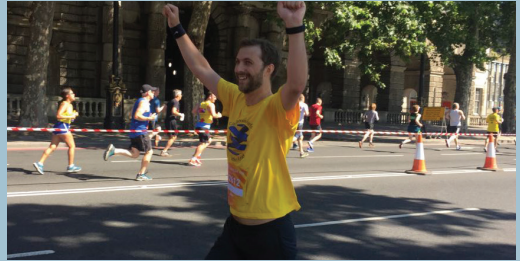
CGEF 10K Run

The Commonwealth Secretary-General Rt Hon Patricia Scotland QC and Their Royal Highnesses the Duke and Duchess of Sussex also attended the event to mark Prince Harry's appointment as the Commonwealth Youth Ambassador.